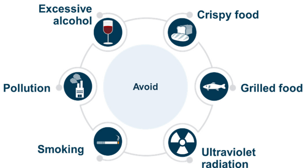
FIGURE 2. Strategies for reducing AGEs: Lifestyle recommendations. 33-36

the investigators showed that consumption of exogenous collagen (5 g, derived from fish) containing high concentrations of prolyl-hydroxyproline and hydroxyprolyl-glycine or placebo for 12 weeks resulted in significantly lower levels of skin AGEs ( P < .05 ) and a slightly lower insulin resistance index (correlation between the rate of change in levels of AGEs and the rate of change in the homeostasis model assessment ratio, [HOMA-R values, an indicator of insulin resistance]). The study formulation was well tolerated, with no significant safety signals reported. 30 Although larger trials in a broader study population are needed, these data suggest that consumable collagen peptides should be further studied as a possible intervention to manage illnesses related to the accumulation of AGEs.