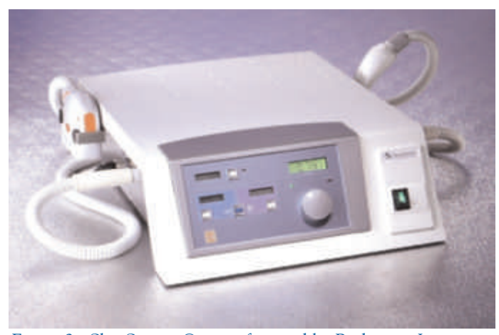
Figure 2. SkinStation® manufactured by Radiancy, Inc.

The clinical trial was performed at the Tennessee Clinical Research Center under the auspices of the Western Institutional Review Board (WIRB), Seattle, Washington. All