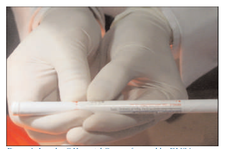
Figure 1. Levulan®Kerastick®manufactured by DUSA Pharmaceuticals, Inc.

photosensitive porphyrins are irradiated with blue light, the singlet oxygen produced selectively destroys the bacterial cells and clears the acne lesions. Clinical trials<sup>9-14</sup> have shown the effectiveness of endogenous PDT with blue light in mild to moderate inflammatory acne. Several laser and light-based systems, including an intense pulsed light (IPL) and heat source (LHE®), have also been shown to be effective in the treatment of mild to moderate inflammatory acne<sup>15-18</sup>.