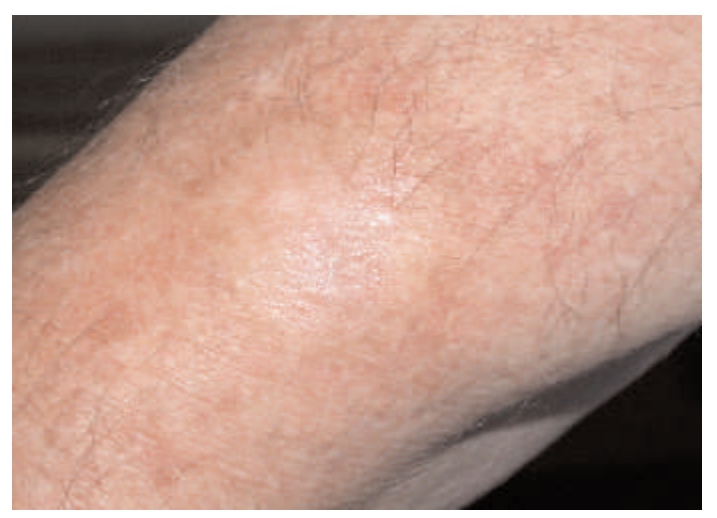
Figure 8. Three months out.