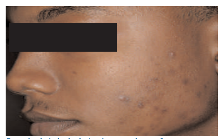
Figure 3a. Left cheek of a female patient shows inflammatory acne lesions before treatment with ALA (Levulan Kerastick) PDT and IPL (SkinStation) activation.