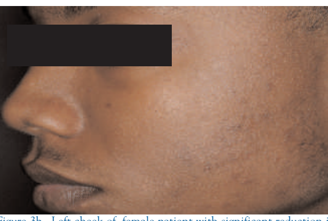
Figure 3b. Left cheek of female patient with significant reduction in acne lesions 12 weeks after the final of four once-weekly treatments.