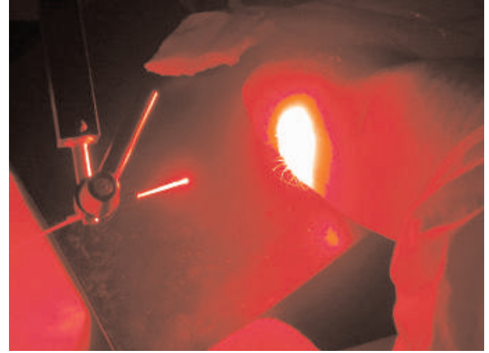
Figure 4. The procedure.