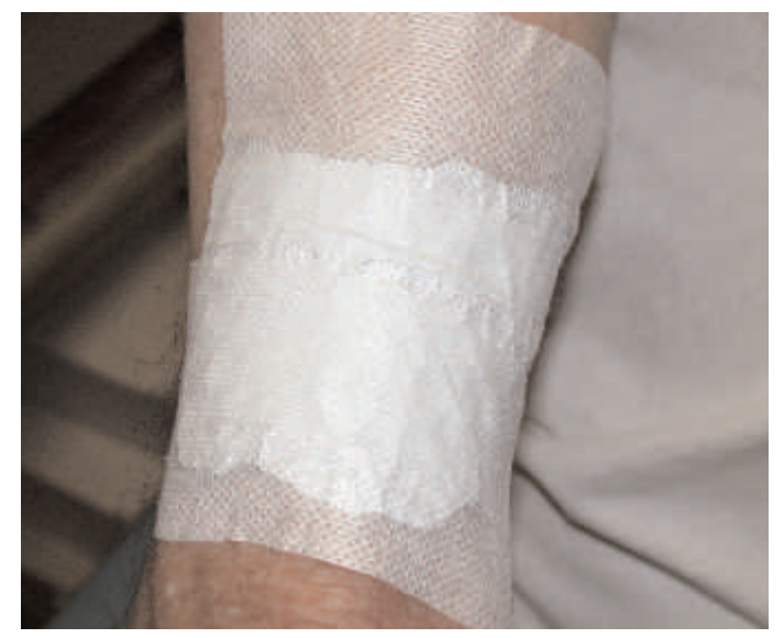
Figure 3. ALA occluded.

Day two, the patient returned for follow-up and photodynamic therapy (PDT) using a 630-nm dye laser. A prescribed light dose of 150 Joules/cm<sup>2</sup> was calculated. The PDT calibrated output power was 2.98 Watts. The treatment area was 12.57cm<sup>2</sup>. Dose rate being equal to output power/treatment area was