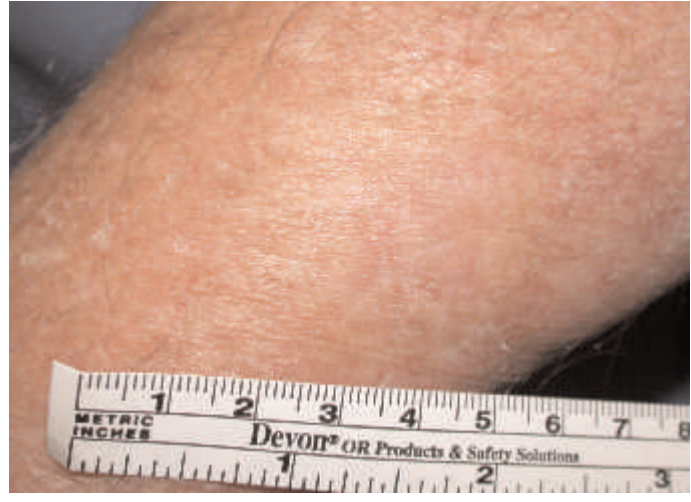
Figure 9. Two years two months out.