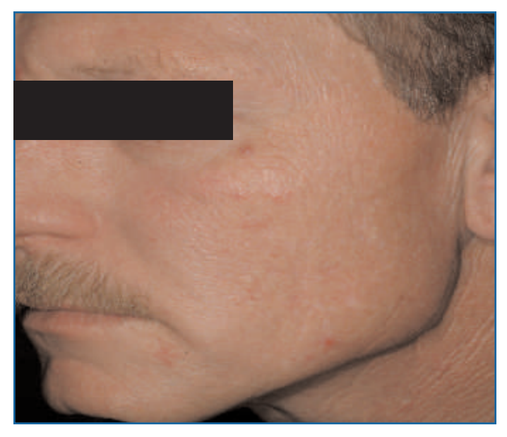
Figure 1A. Sebaceous gland hyperplasia lesions on the patient's cheek before photodynamic therapy with topical 5-aminolevulinic acid photosensitizing agent and intense pulsed light activation.