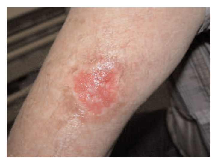
Figure 5. Two weeks out.