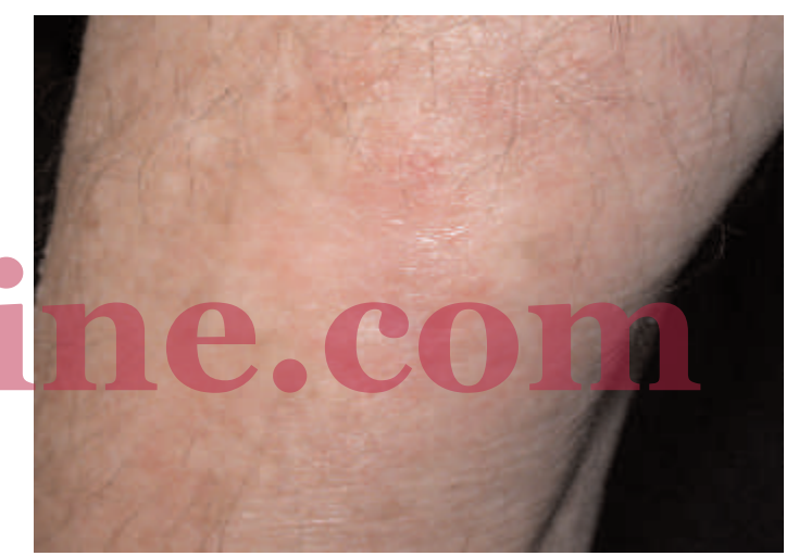
Figure 7. One month out.