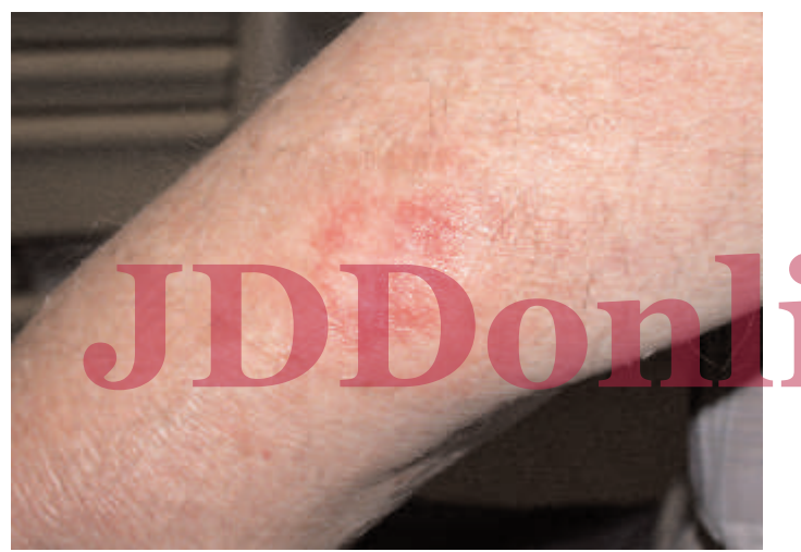
Figure 6. Three weeks out.