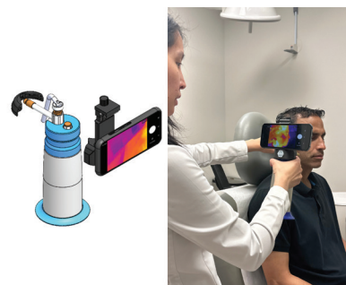
FIGURE 3. The adapter and thermal camera attached to the cryocanister, and the provider performing cryotherapy while capturing

Thermal imaging has been used to assess skin conditions, including psoriasis, skin cancers, burns, and cosmetic treatments such as cryolipolysis. 2 To date, there are no reports on the use of thermal imaging for documentation of cryotherapy treatment sites. With current off-the-shelf thermal cameras, providers are unable to administer LN 2 and subsequently operate a thermal camera quickly enough before treated lesions become undetectable. Incorporation of this novel thermal imaging