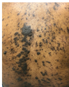
FIGURE 3. Immune checkpoint inhibitor-induced lichenoid dermatitis. Violaceous to hyperpigmented flat topped papules and plaques on the back of a patient with a darker skin phototype.

Widespread application of ICIs is improving cancer outcomes; however, irAEs are common and necessitate rapid and appropriate recognition, diagnosis, and management in order to limit the severity and duration of toxicity that leads to the interruption of therapy and more severe complications and ultimately to promote an optimized quality of life. All clinicians interfacing with cancer patients should be able to recognize these common cutaneous reactions to expedite consultation or proper treatment, as suggested by the multidisciplinary physician-developed algorithm. Moderate-severe or recalcitrant cutaneous reactions are best managed cooperatively with a dermatologist and the oncologic team so that therapeutic interventions have enhanced effects, time away from intended anti-cancer treatment is minimized, and patient experience is improved.