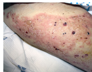
FIGURE 2. Immune checkpoint inhibitor-induced bullous pemphigoid. Urticarial plaques with tense vesicles and bullae and erosions on the thigh of a light-skinned patient.

The oral mucosa is involved in less than one-third of cases. 36,37 Diagnostic evaluation is akin to classic disease, which includes identification of a subepidermal split and numerous eosinophils on histopathology, linear deposition of immunoglobulin G and C3 along the basement membrane on direct immunofluorescence, and peripheral detection of antibodies against hemidesmosomal proteins (BP180 and BP230). 13,25