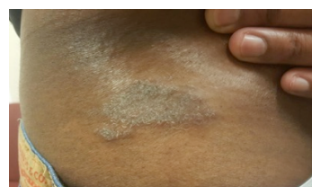
FIGURE 4. Plaque-like atopic dermatitis lesion in an Asian patient.