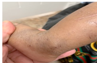
FIGURE 3. Gray appearing atopic dermatitis lesion in a skin of color toddler.