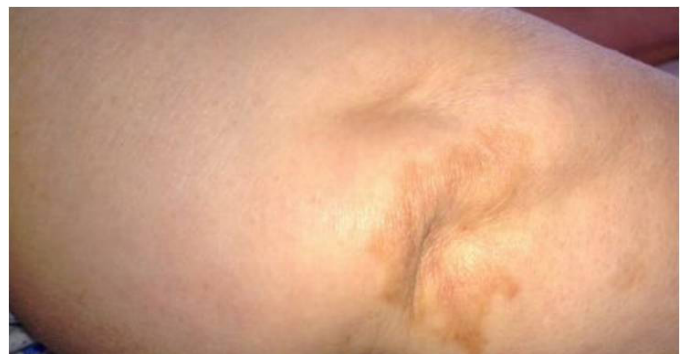
FIGURE 3. Gradual improvement of papules and plaques after the treatment with colchicine therapy.

Aplastic anemia due to dapsone has been reported occasionally. The onset of aplastic anemia has ranged from 2 to 12 weeks following initiation of therapy and has been fatal. A 75-year-old male with granuloma annulare experienced pure