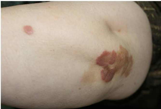
FIGURE 1. Asymptomatic papules and plaques evolving into numerous 0.5 cm to 2.0 cm sized nodules over the elbow.

important role in the pathogenesis of EED. 7 Deposition of immune complexes on the vessels can trigger the chain immunologic reaction to damage the vessels. 8